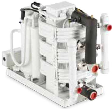
MTCGV 60,000 BTU/hr model shown

New MTCGV R-410A modular chillers provide installation flexibility, reliability, maximum performance, and accessibility for easy maintenance and repair. They are ideal as drop-in replacements for Cruisair MTC R-407C units.