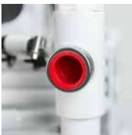
MTCGV water connections match that of the MTC series for seamless retrofitting.