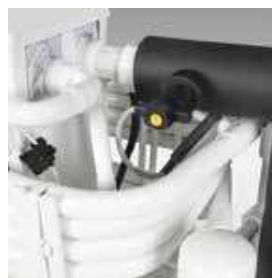
Easily replaceable flow switch.