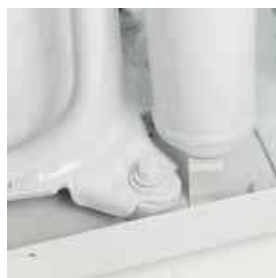
Compressor vibration-isolation mounts reduce noise and vibration transmission to the mounting surface.