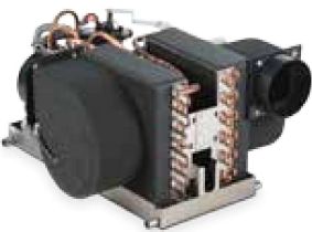
The dual-blower 30,000 BTU/hr unit with stainless-steel chassis.

The 30,000 BTU/h model features dual evaporator coils and a single compressor on a single chassis. The dual high-velocity (HV) blowers can be ducted to two or more interior spaces.