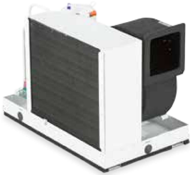
27,000 BTU/hr Compact unit shown

The Compact series of self-contained marine air conditioners offers 18,000 and 27,000, and 30,000 BTU/hr of reverse-cycle cooling and heating.