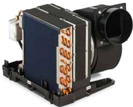
Gold AU12DCZ 12,000 BTU/hr 230V/50-60Hz chilled water air handler shown

Gold Series air handlers, recipient of an Honorable Mention at the 2012 International Boatbuilders Exhibition and Conference (IBEX), incorporate many innovative features, including an optional Breathe Easy™ air purifier and rust-free composite drain pan. AU-DC models feature ultra-quiet "WhisperCool" DC blowers that are strong enough to overcome high-static-pressure duct.