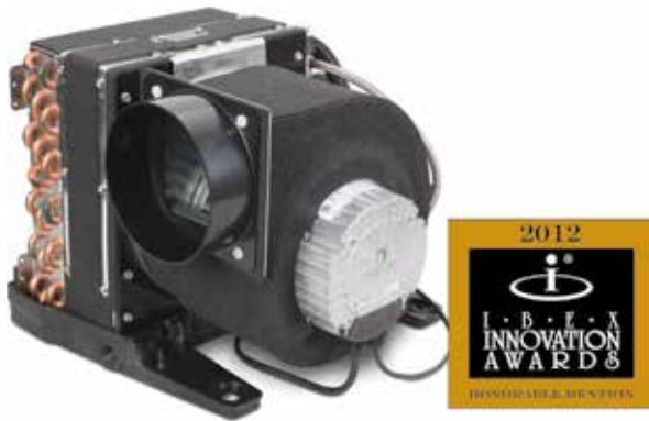
Gold AU12DCZ 12,000 BTU/hr 230V/50-60Hz chilled water air handler shown

Gold Series air handlers, recipient of an Honorable Mention at the 2012 International Boatbuilders Exhibition and Conference (IBEX), incorporate many innovative features, including an optional Breathe Easy™ air purifier and rust-free composite drain pan. AU-DC models feature ultra-quiet "WhisperCool" DC blowers that are strong enough to overcome high-static-pressure duct.